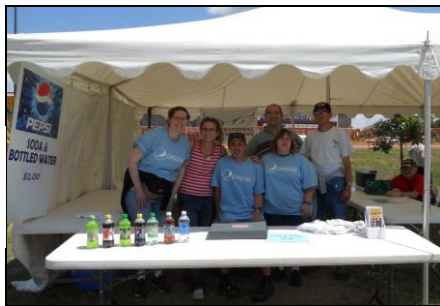
SCI client/workers enjoyed helping the New Richmond Chamber

The second quarter ended with a glorious summer weekend that was filled with hot days, sunny skies, shimmering waters and skies filled with "rocket's red glare". I hope this was enough to persuade you to flee the confines of the indoors and venture outside to enjoy the numerous activities and beauties that a Wisconsin summer affords us. In this issue of What's Happening you will read about some of the opportunities that we at St. Croix Industries have had to get "out and about" and explore our communities... experiencing and learning first-hand about our heritage, the wonders of nature, how companies operate, and the importance of physical exercise to our well being. In addition, we once again had the opportunity to experience giving back to the communities we live in by volunteering at local events. Along the way we have met many wonderful people and expanded our circle of friends.