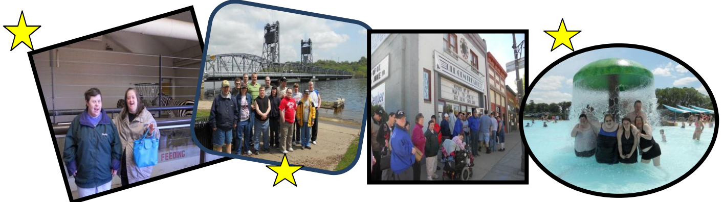
Clients enjoyed the opportunity to go on a variety of community outings during the second quarter. Pictured from left to right: Como Zoo, Stillwater, The Wizard of Oz at the Gem Theater, Wakanda Waterpark in Menomonie.

A sampling of community activities includes volunteering for the New Richmond Chamber at the Park Art Fair, walking at local parks, bowling at Gibby's, cheering for local hockey teams, enjoying a day at Como Park, touring Stillwater, attending a live performance of The Wizard of Oz at the Gem Theater, eating picnic lunches, exploring Carpenter Nature Center, shopping, going to the movies, and swimming at the Wakanda Water Park in Menomonie.